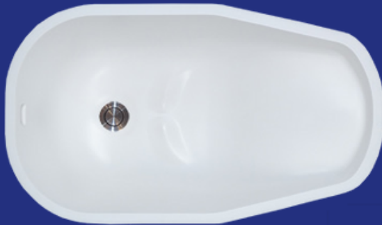
2213-V (VO) I.D.: 22 1/2" x 12 1/2" (572 x 318) Depth 6 1/8"* (156) (Specify if Overflow is required)